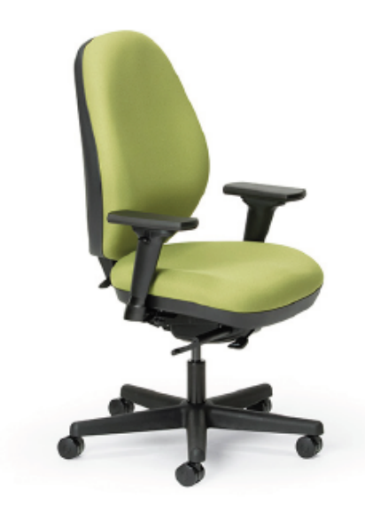
The GoodFit™ Guarantee We guarantee any chair specified by a healthcare professional, using the GoodFit™ app, will completely satisfy you. If it does not, Sitmatic will gladly reconfigure, or replace, that chair until it does.

You provide the measurements for the individual who would be using this chair and we will honor the GoodFit® Guarantee stated above.