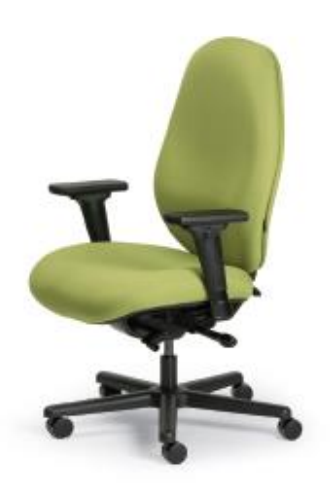
BIG & TALL

The standard above all standards. Designed to fit the masses, from 5'3" to 6'5" and beyond, this chair has your back.